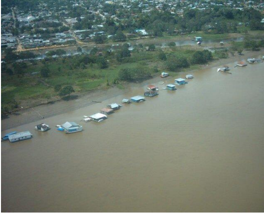
An aerial view of life along the Amazon.

Isaiah 6:8 “ Also, I heard the voice of the Lord saying, Whom shall I send and who will go for us? Then said I, Here am I, send me.”