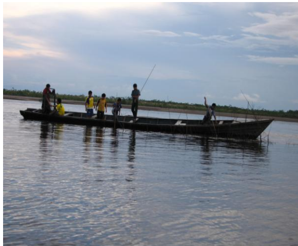
Boys fishing along the Amazon

Matthew 4:19 “And He saith unto them, Follow Me, and I will make you fishers of men.”