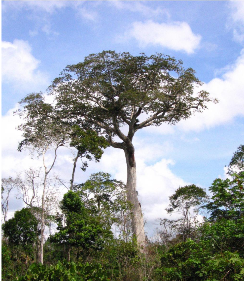
A Yaruma tree along the Amazon

Mateo reassured his mother that he would not disturb the Yaruma trees and Pablo nodded in agreement.