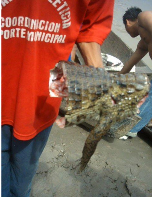
Fresh alligator meat

“Wow!” Pablo said. “Wouldn’t that be great if we brought home an alligator? Our families would be so happy!”