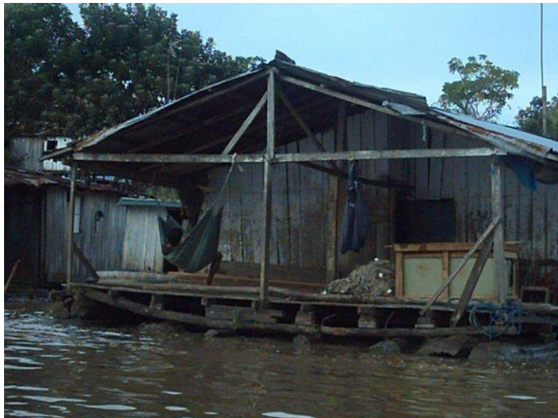
A home in the middle of the Amazon River is a common sight.